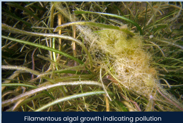
Filamentous algal growth indicating pollution

We propose that a special mooring and buoy system be introduced in the Istanbul Strait to ensure the survival of seagrass meadows.