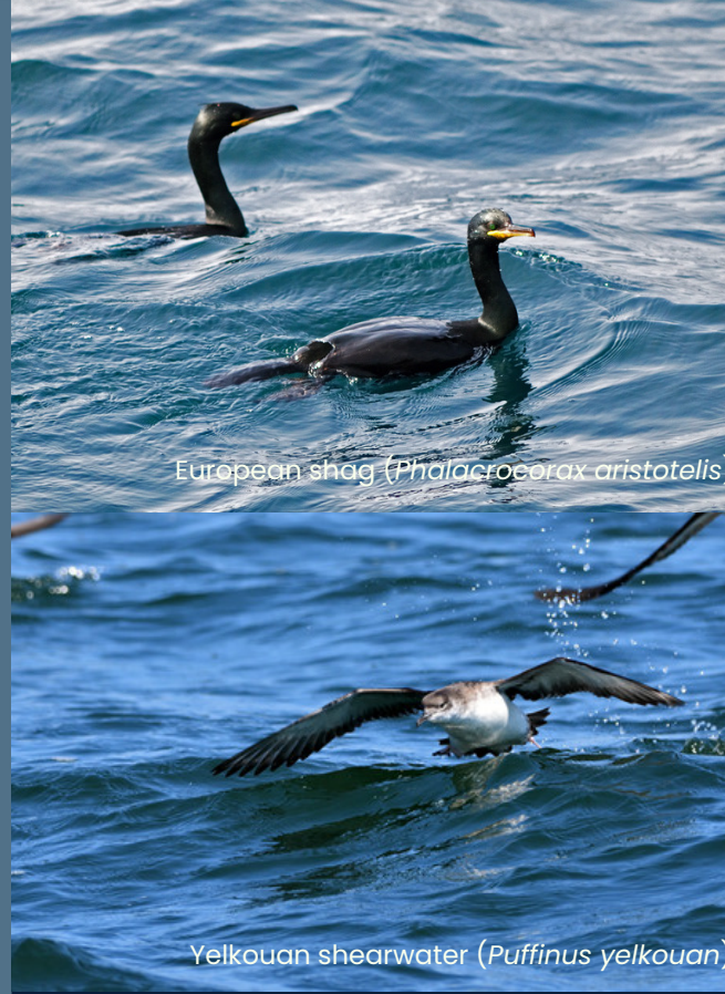
European shag ( Phalacrocorax aristotelis )