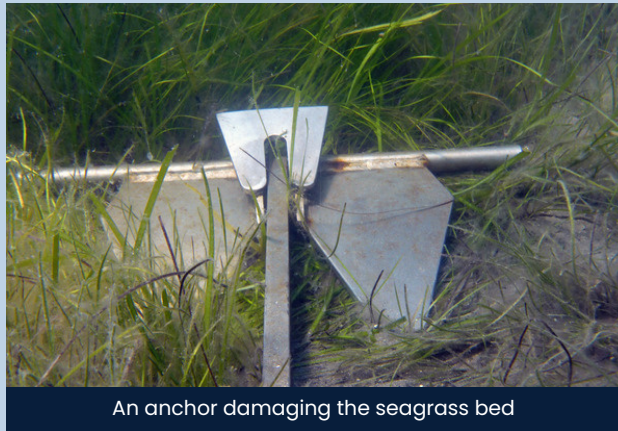
An anchor damaging the seagrass bed

Especially in summer, these boats anchor in seagrass meadows and destroy the habitats of many creatures living on the seabed. There are seagrass meadows in the Istanbul Strait, known as Zostera marina . This sea grass is also under protection. It is also known that the sea grass produce oxygen and protect us against climate change by reducing carbon dioxide in the atmosphere.