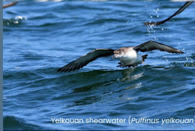
Yelkouan shearwater ( Puffinus yelkouan )